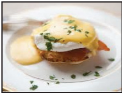
Eggs Benedict Florentine