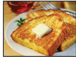
Orange Cinnamon French Toast